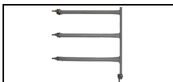
Shelf bracket 2200116 1284999