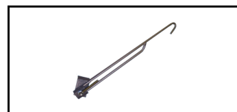
Tie rod w/clamp 26ST1005 5033760