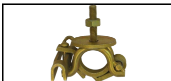
Half Coupler 18SFT100 5189342