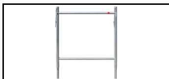
Extension 2200102 5640177