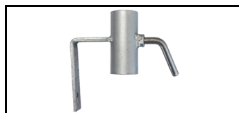
Toeboard clip 2200104 5711084