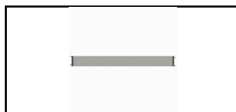
Platform Composite 100KD305H 1784415