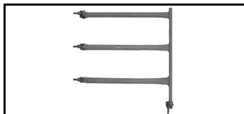
Shelf bracket 2200116 1284999