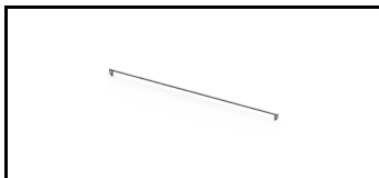
Guardrail single 26SKR300 5033755