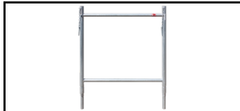
Extension 2200102 5640177