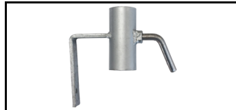
Toeboard clip 2200104 5711084