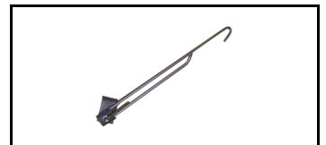
Tie rod w/clamp 26ST1005 5033760