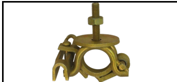
Half Coupler 18SFT100 5189342