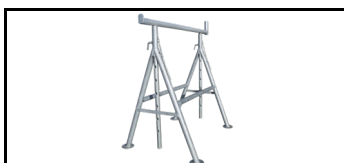
Trestle 2200100 5640175