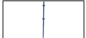
Handrail post for steel railing 2200120 5247433