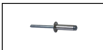
Pop rivet Popnitte6,4x22