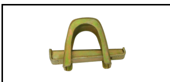
Single Coupler 18SFS216 5189340