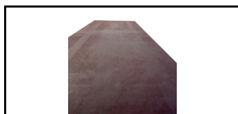
Plywood for platforms w/o hatch 7501780