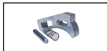
ALU Locking mechanism 1600300