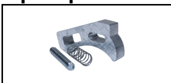
ALU Locking mechanism 1600300