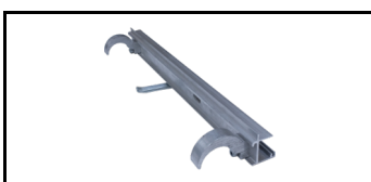
End piece 100305023