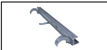
End piece 100305023