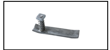
Storm lock 1003050231