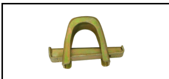
Single Coupler 18SFS216 5189340