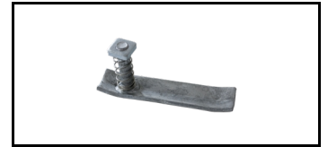
Storm lock 1003050231