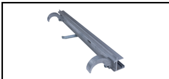
End piece 100305023