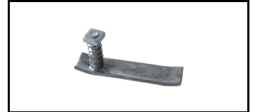
Storm lock 1003050231