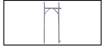
Top frame 2 m