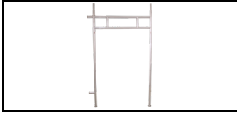
Wide bottom frame