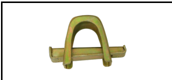
Single Coupler 18SFS216 5189340