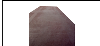
Plywood for platforms w/o hatch 7501780