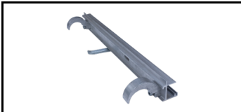
End piece 100305023