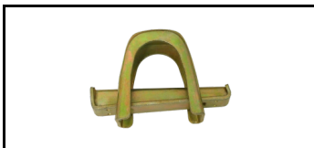
Single Coupler 18SFS216 5189340