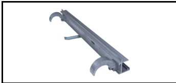
End piece 100305023