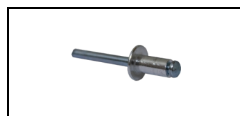
Pop rivet Popnitte6,4x12