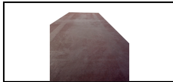
Plywood for platforms w/o hatch 7501780