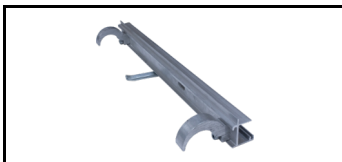
End piece 100305023