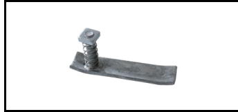
Storm lock 1003050231