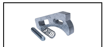
ALU Locking mechanism 1600300