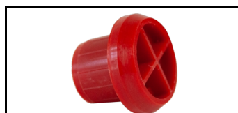
Top plug for screwjack 1400211NY