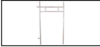
Wide bottom frame 12135225 5189254