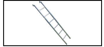
Scaffold Ladders 1550212 5929691