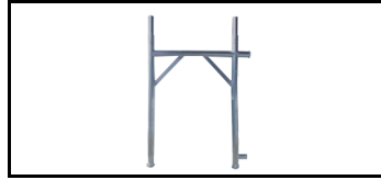
Frame 1 m 12079100s 1252849