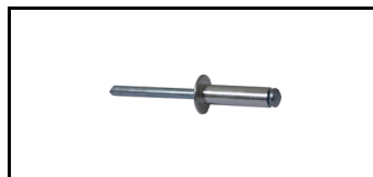
Pop rivet Popnitte6,4x22