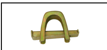
Single Coupler 18SFS216 5189340