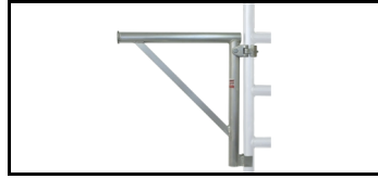
Bracket 1520060 5929687