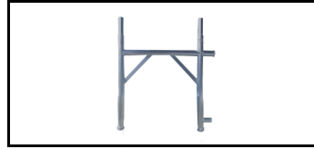
Frame 75 cm 12079075s 1252850