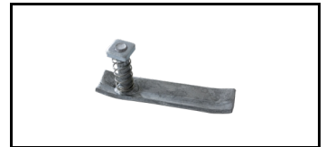
Storm lock 1003050231