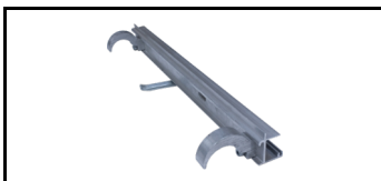
End piece 100305023