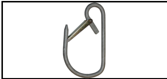
Hook 38GEDA1408 1386840