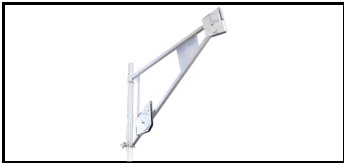
Swivel Arm 38GEDA5711 1542085