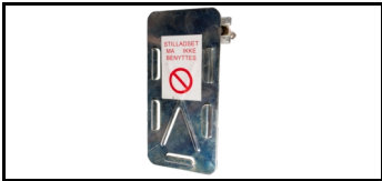
Scaftag Holder 15SHSK 1678716