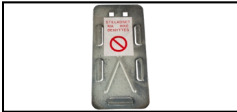
Scaftag holder 15SHS 1678715