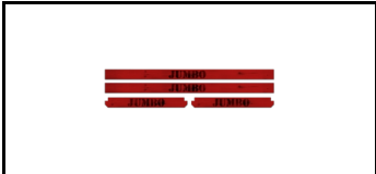
Toeboard Sets 1620250b 5741552