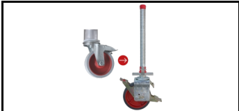
Exchanges castors 1400204 7782766