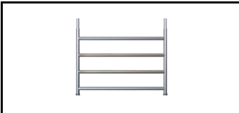
Frame 1 m 12135100 7782790