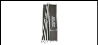
Platform Sets w/Railing 102501BK 7782725