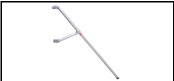
Outrigger 1410150 7782741