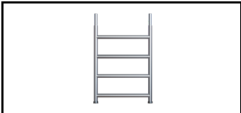
Frame 1 m 12074100 7782816