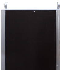
Non-slip platforms equipped with staggered hooks, which makes lengthwise extention without displacement possible