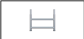
Frame 0,5 m 12074050 5929662