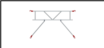
Railing w/diagonals 1102500-AGR 2335720