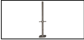
Combiflex Universal Jack 74 cm. 21JCF740F 1675053