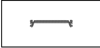
Combiflex Horizontal 21JCF70H 1608395