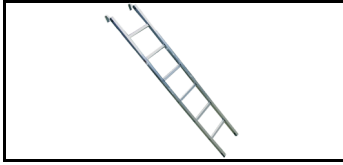
Scaffold Ladders 1550212 5929691