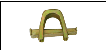
Single Coupler 18SFS216 5189340