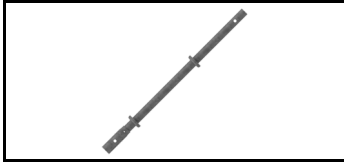
Combiflex Standard 21JCF100S 1608363