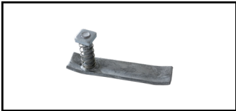
Storm lock 1003050231