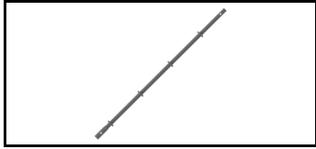
Combiflex Standard 21JCF200S 1608388