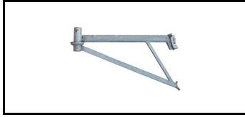
Combiflex Bracket 21JCF70KH 1616373