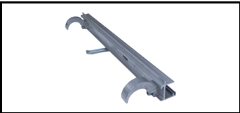
End piece 100305023