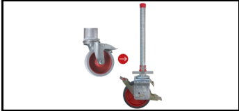
Exchange castors 1400204S 5929683