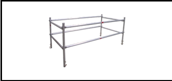
Railing set 178SK-G 5246336