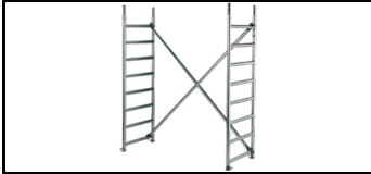
Extension for folding scaffolds 178SK-2 5929667