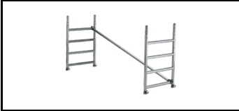
Extension for folding scaffolds 178SK-1 5929666