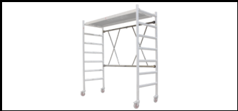
The folding part Foldedel 178 SUPER