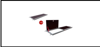
Exchange of platform folding scaffolding 1010178 5929703