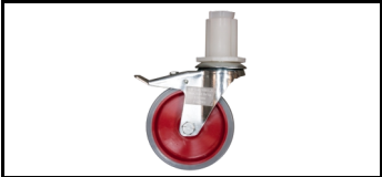
Castor w/brakes 1400125 5929680