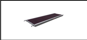
Platform w/o hatch 1001780 7782840