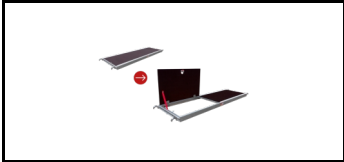
Exchange of platform folding scaffolding 1010178 5929703