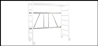
The folding part Foldedel 178 cm.