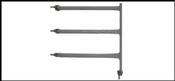
Shelf bracket 2200116 1284999