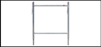
Extension 2200102 5640177