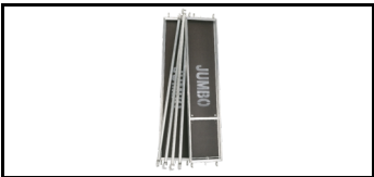
Platform Sets w/Railing 102501BK 7782725