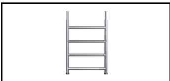
Frame 1 m 12074100 7782816