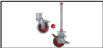
Exchanges castors 1400204 7782766