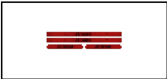
Toeboard Sets 1620178s 5741563