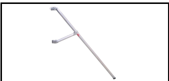
Outrigger 1410250 7782758