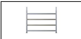
Frame 1 m 12135100 7782790