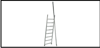
Extensions set for single towers s-1 7782717