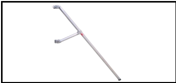
Outrigger 1410250 7782758