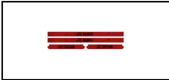
Read in the description what the set consists of 1620250s 5741564