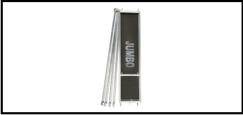
Platform Sets w/Railing 102501sk 7782733