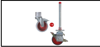
Exchanges castors 1400204 7782766