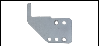
Bottom bracket 4141029