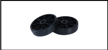
Wall Wheels 4141014