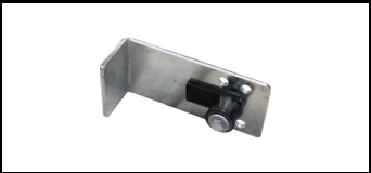
Top bracket 4141028