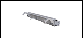
End piece 100305024