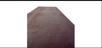
Plywood for platforms with hatch 7502501s