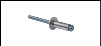
Pop rivet Popnitte6,4x18