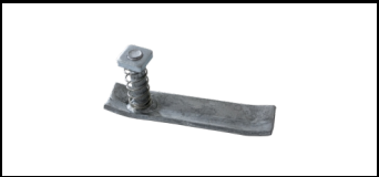
Storm lock 1003050231