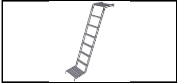
Stairway 26GS1111 5033770