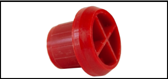
Top plug for screwjack 1400211NY