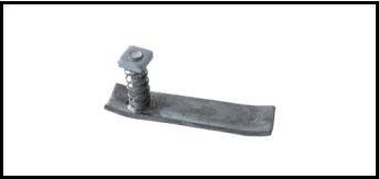
Storm lock 1003050231