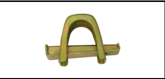
Single Coupler 18SFS216 5189340