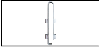
Beam rider 26GS1033 5033765