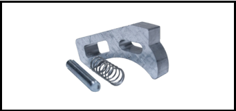
ALU Locking mechanism 1600300