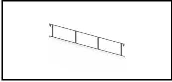
Guardrail double 26SKRV300 1526172