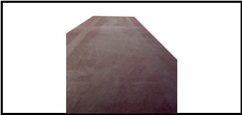
Plywood for platforms w/o hatch 7501780