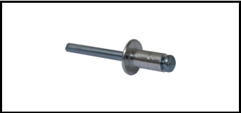
Pop rivet Popnitte6,4x12