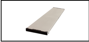
Composite Platform 26ST1107 1586206