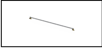
Diagonal brace 26GS1041 5033753