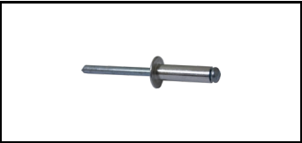
Pop rivet Popnitte6,4x22