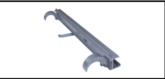
End piece 100305023