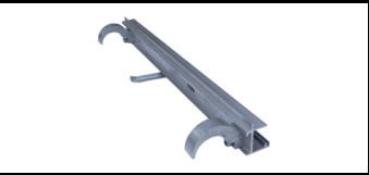
End piece 100305023