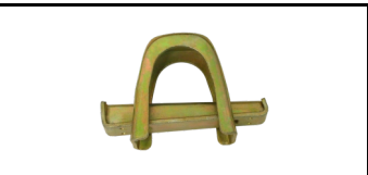
Single Coupler 18SFS216 5189340