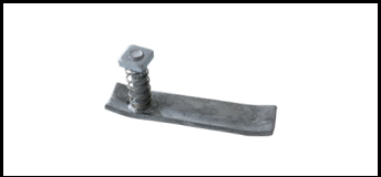
Storm lock 1003050231