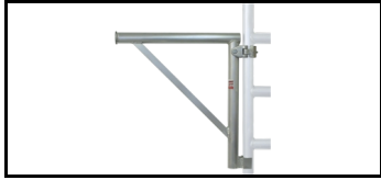
Bracket 1520060 5929687