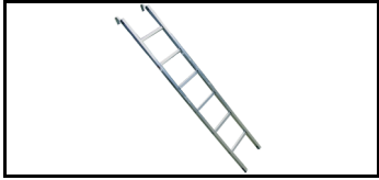
Scaffold Ladders 1550212 5929691