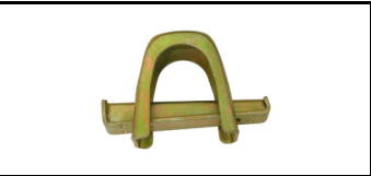
Single Coupler 18SFS216 5189340