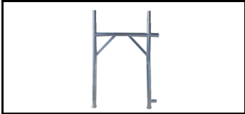
Frame 1 m 12079100s 1252849