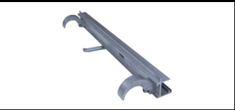
End piece 100305023