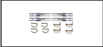
Set of connection pieces 1420104 5929685