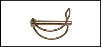
Pins 1600150 1607280