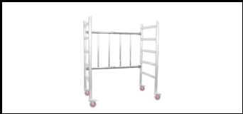
The folding part Foldedel 128 cm.