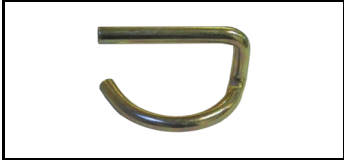
Safety clips 1600100 5929697