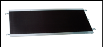
Platform w/o hatch 1001280 5929702