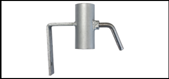
Toeboard clip 2200104 5711084