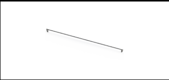
Guardrail single 26SKR300 5033755