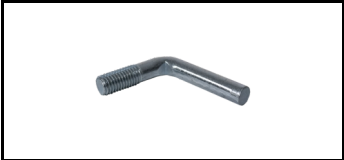
handle screw 2200114 1726618