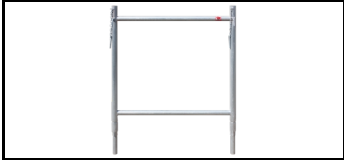
Extension 2200102 5640177