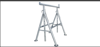
Trestle 2200100 5640175