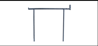
Trestle top 2200107 5711088