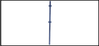
Handrail post for steel railing 2200120 5247433