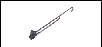
Tie rod w/clamp 26ST1005 5033760