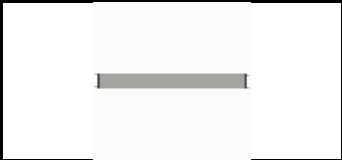
Platform Composite 100KD305H 1784415