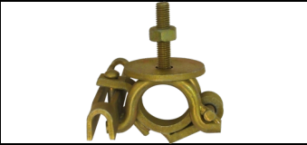
Half Coupler 18SFT100 5189342