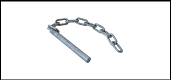
Split pen with chain 2200117 1726619