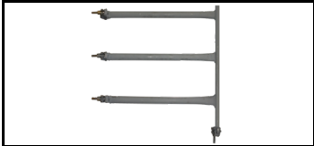
Shelf bracket 2200116 1284999