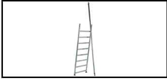
Extensions set for single towers s-1305 5929675