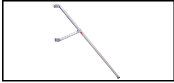
Outrigger 1410150 7782741