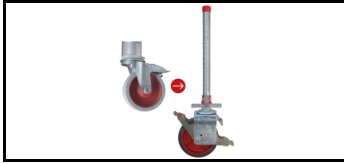
Exchanges castors 1400204 7782766