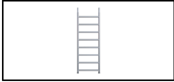
Frame 2 m 12074200 7782808