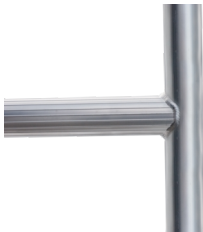
Fully welded frames