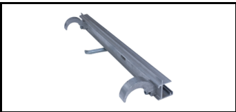
End piece 100305023