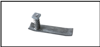
Storm lock 1003050231