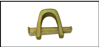
Single Coupler 18SFS216 5189340