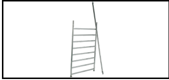
Extensions set for double towers b-1178 5929672