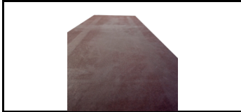
Plywood for platforms w/o hatch 7501780