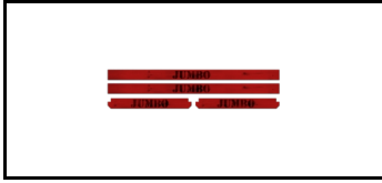
Read in the description what the set consists of 1620250s 5741564