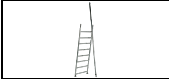
Extensions set for single towers s-1 7782717