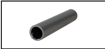
Intermediate pipe 41TSS916