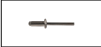
Pop rivet 41JSS904