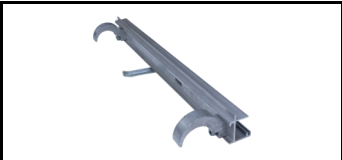
End piece 100305023