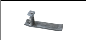
Storm lock 1003050231