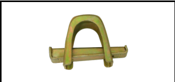
Single Coupler 18SFS216 5189340