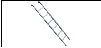
Scaffold Ladders 1550212 5929691