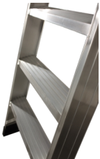
10 cm wide non-skid steps.