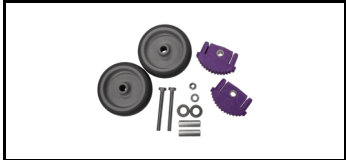
Wheel set 45TSE910