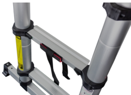
38 mm ergonomic steps