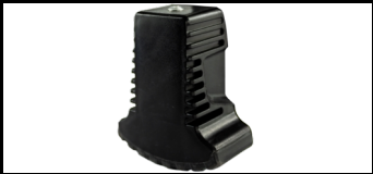
XT Foot for ladder stabiliser 41XT900