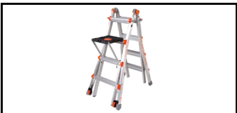
Tool Tray 41LG012 1607745