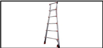
Outer part 41LG963