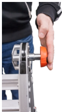
Palm button system makes it easy to adjust the hinge. Just push straight in on each button and open the ladder to the desired position!