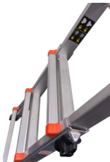
Angled steps ensure a plane standing ground. Single step width 25 mm - when steps on the inner and outer ladder are in line the total step width is 80 mm.