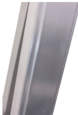
Constructed from high strength aluminium with great corrosion resistance - gives a strong and sturdy yet light ladder