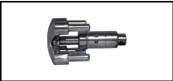
4-point lock 41LG955