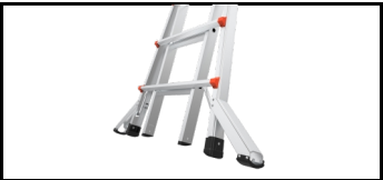
Support legs 41LG966