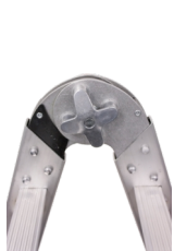
Extra durable hinge with 4-point Quad-Lock™