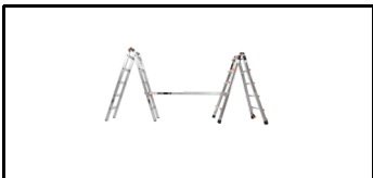
Teleskopik Plank 41LG244 1270706