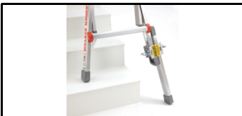
Leg Leveler 41LG105 1270696