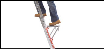
Safety Platform 41LG104 1270701