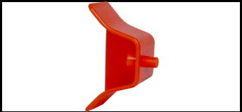
Rung End Cap 41LG954