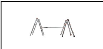
Teleskopik Plank 41LG183 1270704