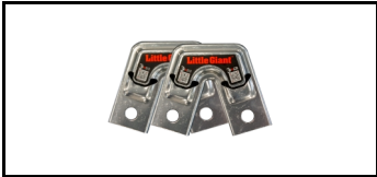
Hinges (aluminium) 41LG212 1611766