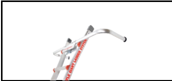
Wing Span 41LG111 1270699