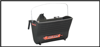
Painting Bucket 41LG050 1607744