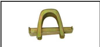
Single Coupler 18SFS216 5189340