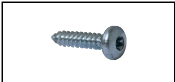
Screw 5,5x25 skruer