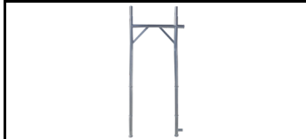
Frame 2 m 12079200s 1252848