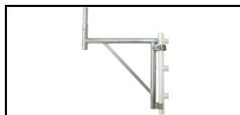
Bracket 1520060hs 1252857