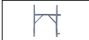
Frame 75 cm 12079075s 1252850