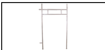
Wide bottom frame 12135225 5189254