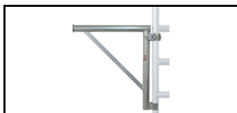
Bracket 1520060 5929687