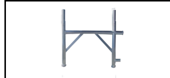
Frame 50 cm 12079050s 1252851