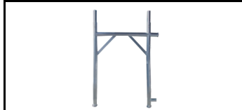
Frame 1 m 12079100s 1252849