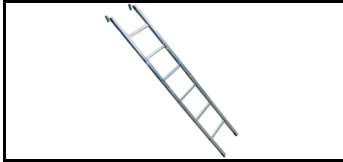
Scaffold Ladders 1550212 5929691