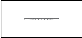
Combiflex Beam 21JCF300HF 1608417