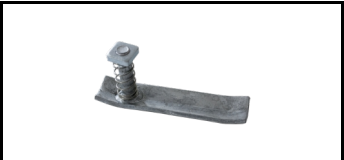
Storm lock 1003050231