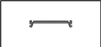
Combiflex Horizontal Braces 21JCF70H 1608395