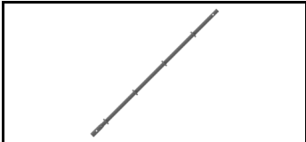
Combiflex Standard 21JCF200S 1608388