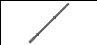
Combiflex Standard 21JCF100S 1608363