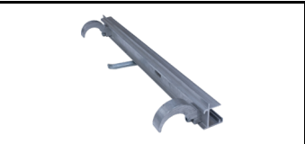
End piece 100305023