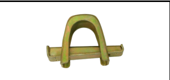
Single Coupler 18SFS216 5189340