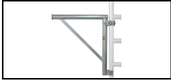
Bracket 1520060 5929687