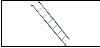
Scaffold Ladders 1550212 5929691