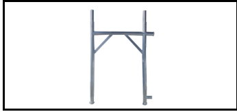
Frame 1 m 12079100s 1252849