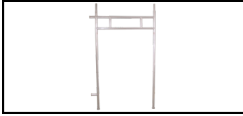
Wide bottom frame 12135225 5189254