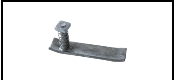
Storm lock 1003050231