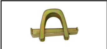
Single Coupler 18SFS216 5189340