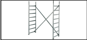
Extension for folding scaffolds 178SK-2 5929667