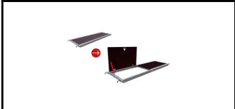
Exchange of platform folding scaffolding 1010178 5929703