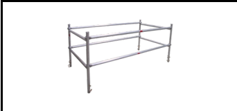
Railing set 178SK-G 5246336