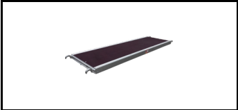
Platform w/o hatch 1001780 7782840