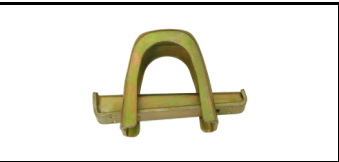
Single Coupler 18SFS216 5189340