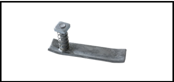
Storm lock 1003050231