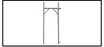
Top frame 2 m 12079200 5929665