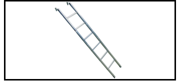
Scaffold Ladders 1550212 5929691