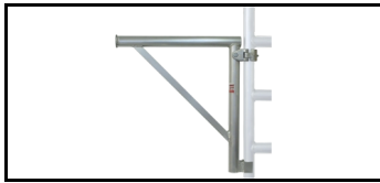
Bracket 1520060 5929687