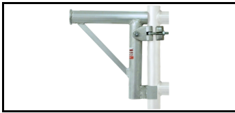
Bracket 1520030 5189257