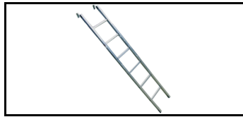
Scaffold Ladders 1550212 5929691