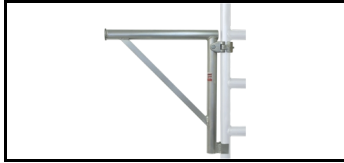
Bracket 1520060 5929687