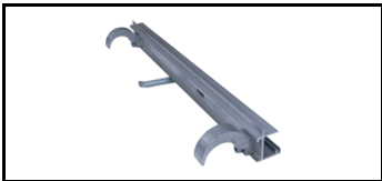
End piece 100305023