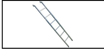
Scaffold Ladders 1550212 5929691