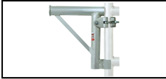
Bracket 1520030 5189257