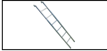
Scaffold Ladders 1550212 5929691