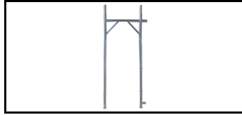
Top frame 2 m 12079200 5929665