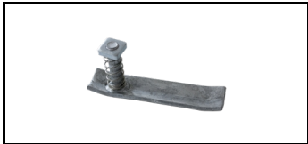
Storm lock 1003050231