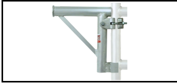
Bracket 1520030 5189257