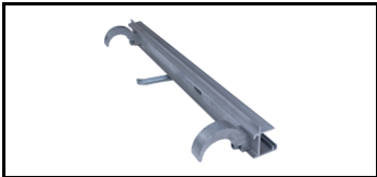
End piece 100305023