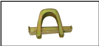
Single Coupler 18SFS216 5189340