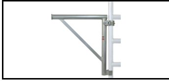
Bracket 1520060 5929687