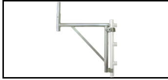
Bracket 1520060H 5929688