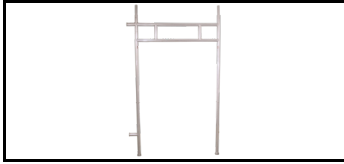
Wide bottom frame 12135225 5189254