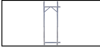
Bottom frame 2 m 12077200 5929664