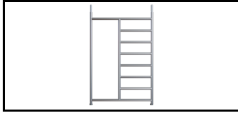
Open frame 12131200 5189252